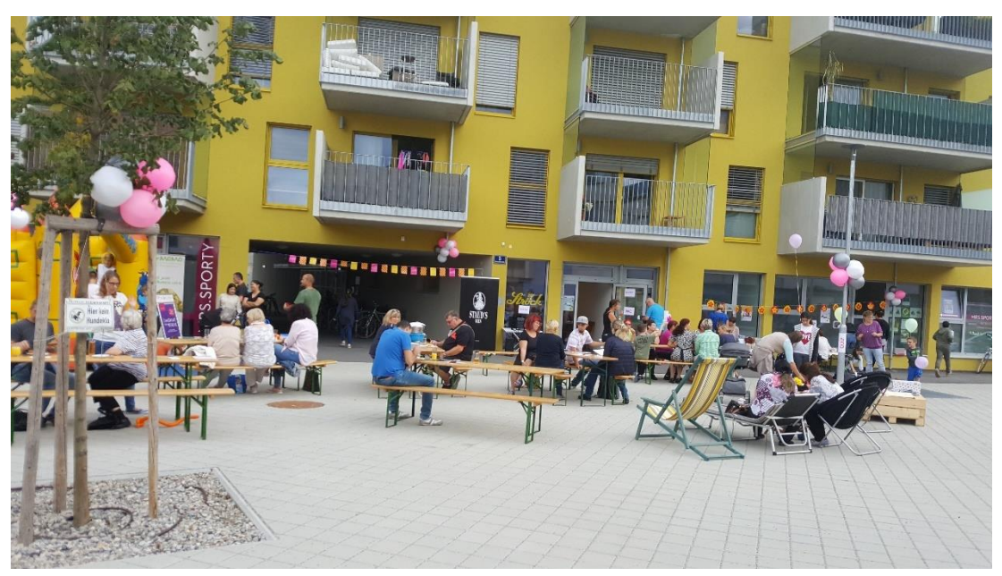
Figure 1: Neighbourly opening ceremony in the case study area