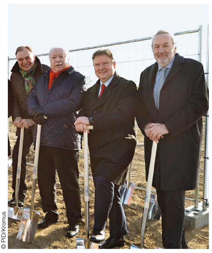
GESIBA CEO Kirschner with Mayor Häupl, Executive City Councillor Ludwig and District Chairman Kandl turning the sod

The City of Vienna supported the construction of the Fontanastrasse project with funds amounting to Euro 6.7 million against a total construction cost of approx. Euro 14 million. "Currently, 28 lots with 2,450 new municipal housing units in nine districts of Vienna are on the road from planning to implementation. We are therefore well on track towards attaining our goal of providing around 4,000 new dwellings by the end of 2020", Executive City Councillor Michael Ludwig remarked.