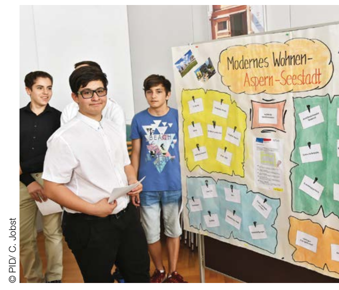
Schoolchildren present their project results in an exhibition at the Vienna School Board.