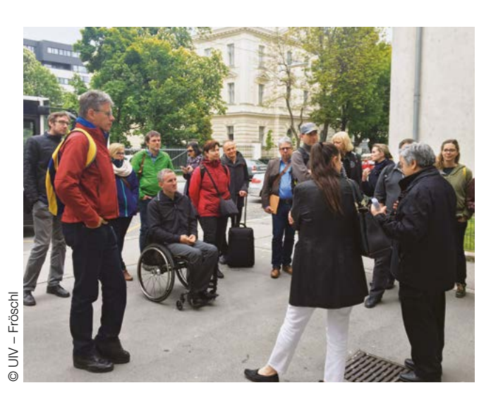
Delegations from 12 European cities at the meeting of the EUROCITIES Working Group on Housing

The topic of long-term financing of housing projects was discussed in the framework of the EUROCITIES conference "Economic Development Forum", which took place in Vienna from 16 to 18 October 2017.