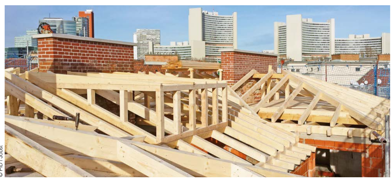
Attic conversions create new space for living.

The overall refurbishment and roof storey conversion of Goethehof will proceed until 2019, involving an investment volume of approx. Euro 45 million and subsidies disbursed