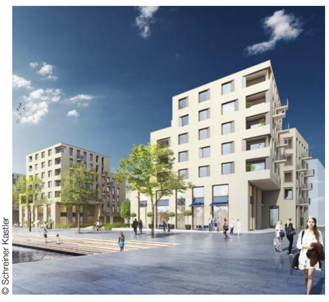
aspern Seestadt, Lot H7B: Subsidised housing in a top location directly by the lake (22nd municipal district)

Vienna's largest urban expansion area aspern Seestadt ("Vienna's Urban Lakeside") entered its next development phase in 2017. The "Quartier Am Seebogen" developers' competition comprised six lots, which will accommodate approx. 650 subsidised and approx. 80 privately financed