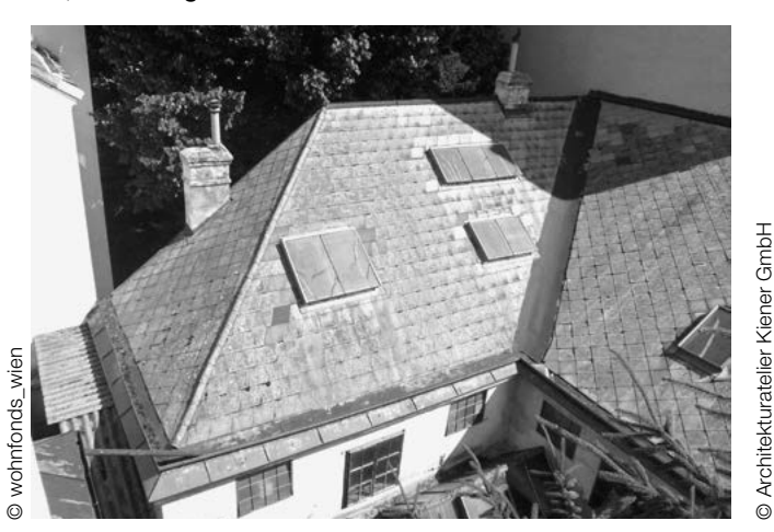
Interior courtyard before refurbishment