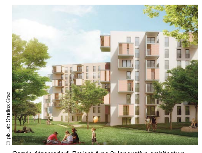
Carrée Atzgersdorf, Project Area 2: Innovative architecture and ample green spaces

The "Carrée Atzgersdorf" developers' competition (23<sup>rd</sup> municipal district) was concluded in early 2017. Roughly 1,200 mostly subsidised rental flats, premises for shops – including a medical practice and a six-group kindergarten – will be built on the competition site, which extends over approx. 61,500 square metres. The focuses were on the creation of facilities spanning several lots, e.g. a play street, a forecourt, a playground for younger kids and teens as well as a central open space with a communal house.