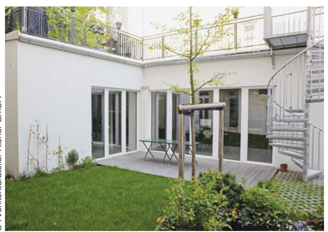
Interior courtyard after refurbishment