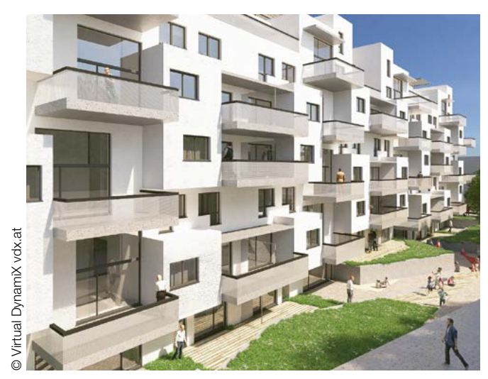
Different housing options in Mühlgrundgasse 1

By 2020, approx. 70 subsidised housing units for people from different generations and in different life situations will be built in the 22<sup>nd</sup> municipal district. The winning project resulting from the "Mühlgrundgasse II" developers' competition convinces with its barrier-free dwellings characterised by high ceilings, numerous communal facilities and an accompanying management plan to ease moving in and foster neighbourhood building.