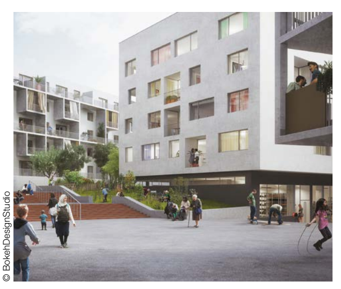
Lot in Puchsbaumgasse: Open space as a place of encounter

in 2019. They will comprise a total of roughly 380 subsidised flats, 190 subsidised hostel units for young people and four premises for shops, all embedded in high-quality open and green spaces. This is the outcome of a time-saving "combined" developers' competition, which conflated the procedure of defining a land use and development plan with the developers' competition proper.