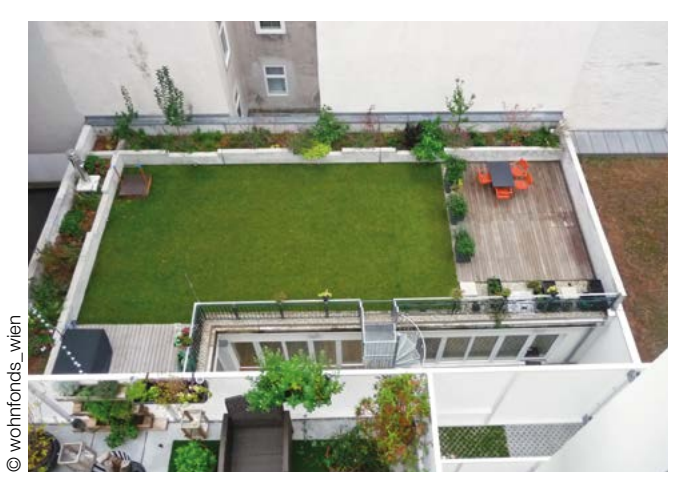
Interior courtyard after refurbishment